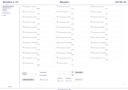
The view of the start page can vary by different device types or versions. The picture above shows the start page of a EtherSens Energy device.

Now the web-server of the EtherSens-device/ MONI should show up with the following start-screen: